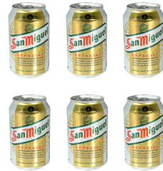
"San Miguel" beer Can 33 cl. 6 u.