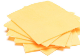
Gouda Sliced Cheese "Meys " blister of 80 gr.