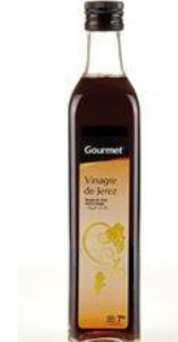
White Wine vinegar bottle 50cl.