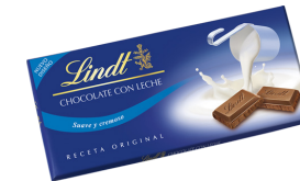
Milk Chocolate Bar "Lindt " Bar of 125 gr.