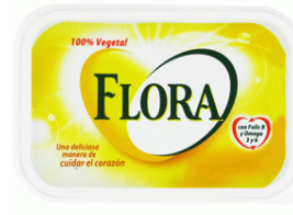
Margarine (butter) "Flora" 250 gr.