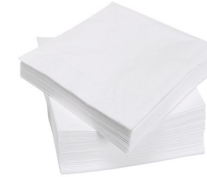
Paper Serviette 33 x 33 ( 70 u. )