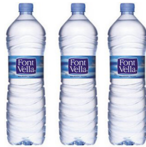
3 x mineral water "Font Vella" 1,5 L.