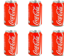
Coca Cola Can 33 cl. 6 u.