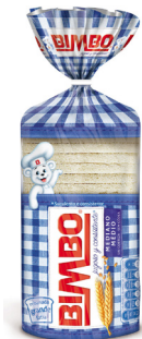
Crustless Sliced bread "Bimbo" 450 gr.