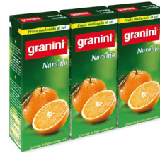
Orange Juice "Granini" pack 3 bricks 600 ml.