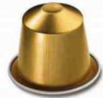
10 x Nespresso Coffee Capsules Volluto