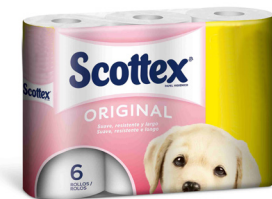
6 x Toilet Paper "Scottex"