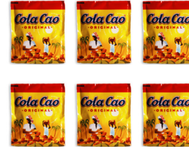
Powdered Cocoa "Colacao" 6 sachets of 18 gr.