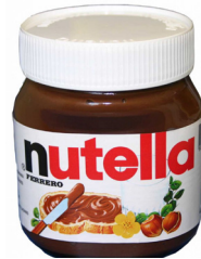
Cacao Cream Nutella 400 gr.