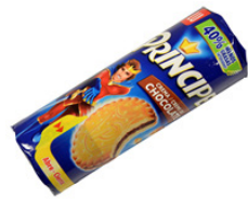
Chocolate cookies "Principe lu" 300 gr.