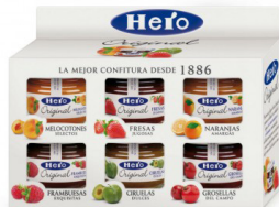
Assortment of Jam "Hero" pack of 6 x 30 gr.