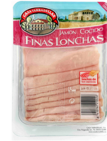
Sliced Ham "Casa Tarradellas " blister of 125 gr.