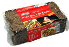
Rye and oat bread 500 gr.