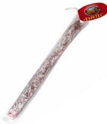
Spicy pork sausage "Casa Tarradellas " 185 gr.