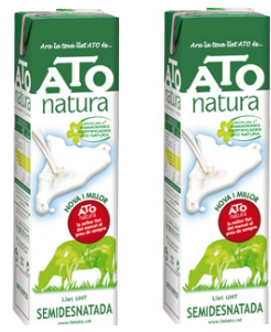
2 x Skimmed Milk "ATO" Brick 1 L.