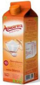
White Sugar "Azucarera" 750 gr.